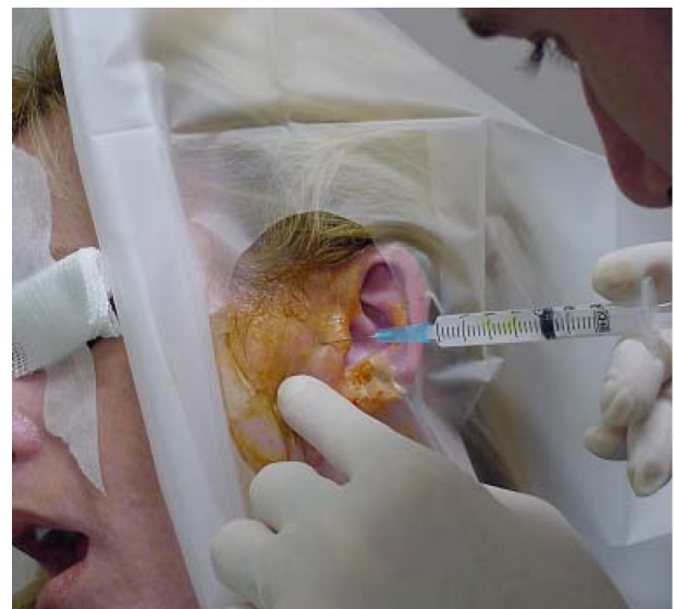
Figure 2 Temporomandibular joint injection.

Tricyclic antidepressants like amitriptyline and nortriptyline may be used for more chronic MFP. 21,31 In addition, they can be prescribed for the TMD patient who has tension-