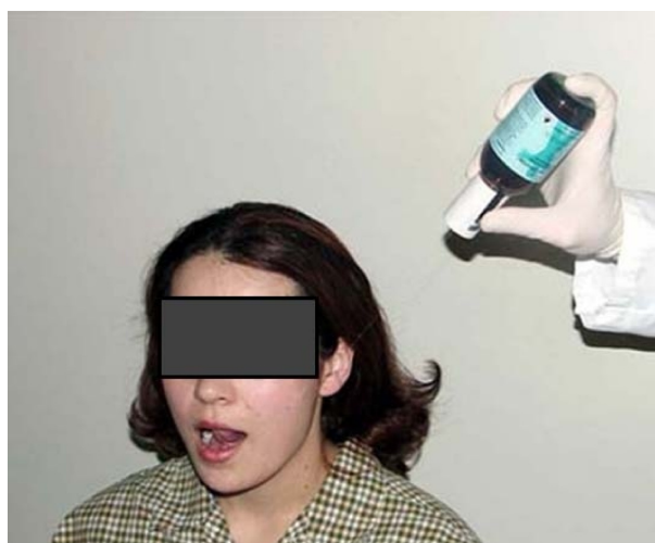
Figure 1 Jaw N-stretch with vapocoolant spray.

Medications are an effective addition in managing the symptomatology of intracapsular disorders. 1 Commonly used pharmacological agents for the treatment of TMJ disorders include analgesics, nonsteroidal anti-inflammatory drugs (NSAIDs), local anesthetics, oral and injectable corticosteroids, sodium hyaluronate injections, muscle relaxants, botulinum toxin